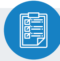
Inspections & Assessments