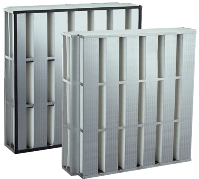
Donaldson P199753 Cabin Air Filter (Boeing S161N300-1)

Due to a variety of filtration ratings and specifications, Boeing created the stringent and universal SCD# S161N300 for the 737 and 757 Cabin Recirculation Filter. Our filter P199753 (Boeing Part Number S161N300-1) is the only filter that meets Boeing's SCD requirements. Any competitive part numbers listed in the IPC do not meet Boeing's requirements for SCD# S161N300.