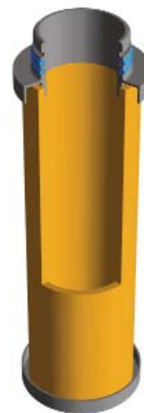
Ultraporex SB Particle Filter Element

By utilizing various filtration mechanisms such as direct impaction, sieving, and diffusion, liquid aerosols and solid particles will be retained in the filter down to the 5 µm particles size. The high-grade sintered bronze media ensures not only a high-load capacity of contaminants, but it has the ability to be regenerated many times.