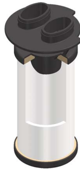
Ultrapoly Particle Prefilter Element Type P

elements utilize a highly porous sintered polyethylene media for absolute filtration of particles down to 25 µm in size. The primary filtration mechanism of this media is sieving, which captures most particles near the surface allowing for regeneration of the element and reduced operating cost through fewer element change-outs. Although the Ultrapoly P is primarily used as a particulate prefilter, a simple reversal of flow through the element allows the Ultrapoly P to be used as an effective coarse coalescing filter element, removing bulk quantities of water and oil from an air or gas stream (standard housings are equipped with an internal float drain, so no special equipment is required).