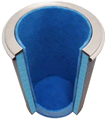
Picture is for representation only. Final filter is purchased separately.

The CFS Prefilter, with integral bottom, extends the life of the primary filter by capturing larger particulate, such as seeds, leaves and large airborne fibers. It is made of a lofted, low-efficiency synthetic material, and is designed to be changed more often than primary filters. They are economical, disposable and easy to install.